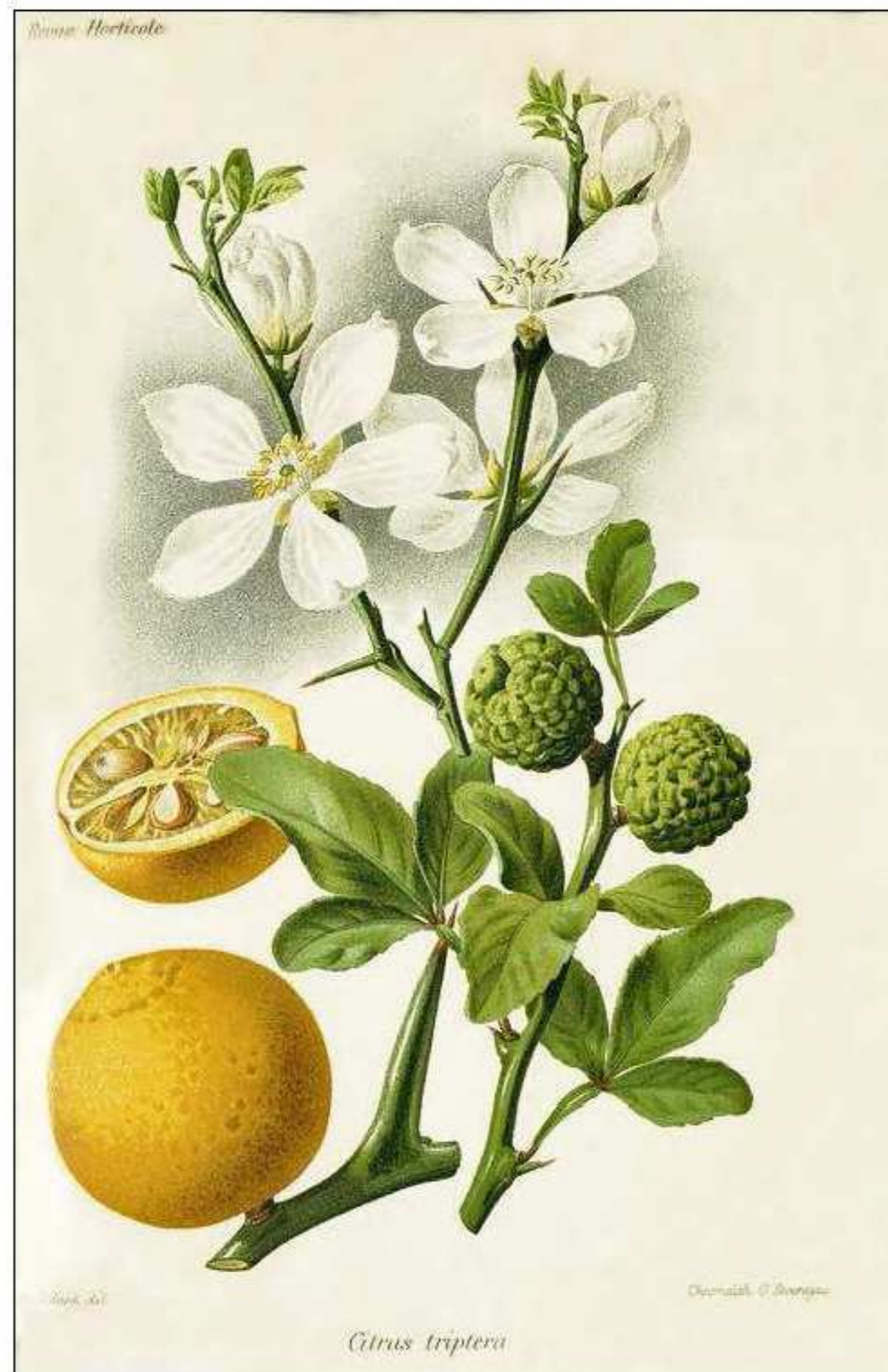
Figure 2. Citrus triptera Desf. (= C. trifoliata ), from André (1885).

Trifoliate orange freely hybridizes with other Citrus species and was used in the USDA citrus breeding program, beginning in Florida in 1897 and continuing for several decades. This work produced a series of hybrids — (X kumquats ( Fortunella ) = citrusquats; X sweet oranges = citranges; X pummelos = citrumelos; X mandarins = citrandarins; X lemons = citremons; and X sour oranges = citradias) (Swingle & Reece 1967).